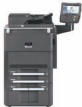
Shown with standard 270 sheet DSDP