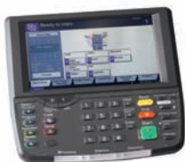
Newly designed, easy-to-use large color touch screen control panel