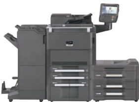
Shown with standard 270 sheet DSDP, optional 500 x 2 sheet paper trays, 500 sheet multi-purpose tray, and 4,000 sheet finisher