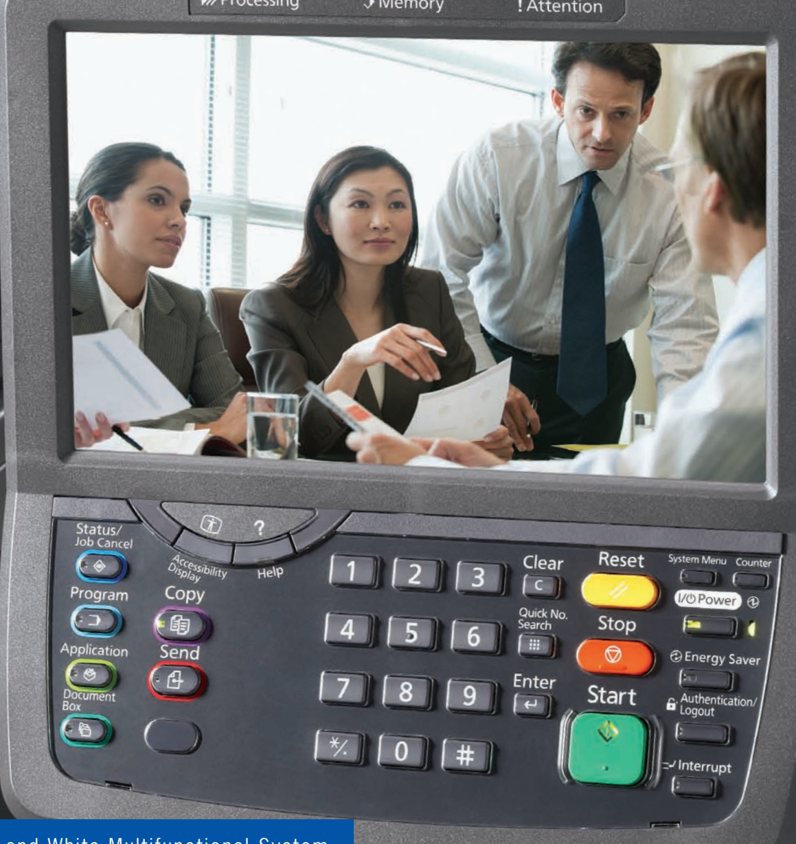
TASKalfa 8000i | Black and White Multifunctional System