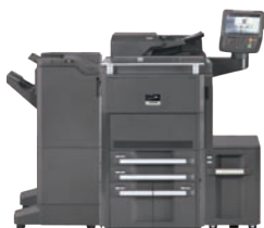
Shown with standard 270 sheet DSDP, optional 3,000 sheet side LCT and 4,000 sheet finisher